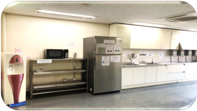
1. Kitchen (Even# Floor)