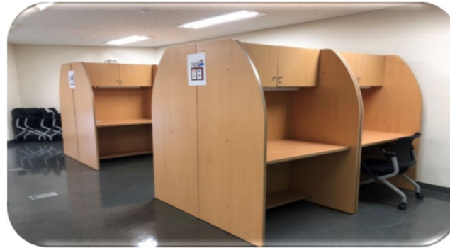
2. Study Room (Odd# Floor)