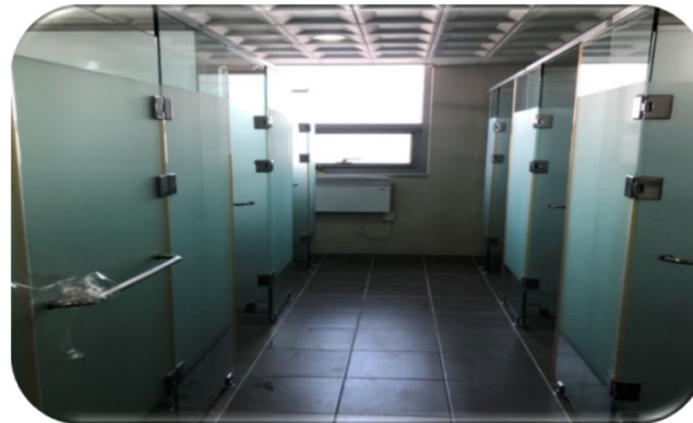
4. Shower Room